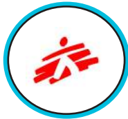
Doctors Without Borders