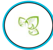
Al Jalila Foundation