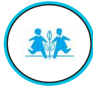
SOS Children's Villages